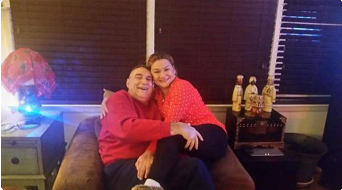
I will miss you always!!